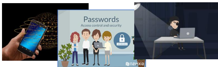
Videos and quizzes

Any question? Do not hesitate to contact us at info@navixia.com